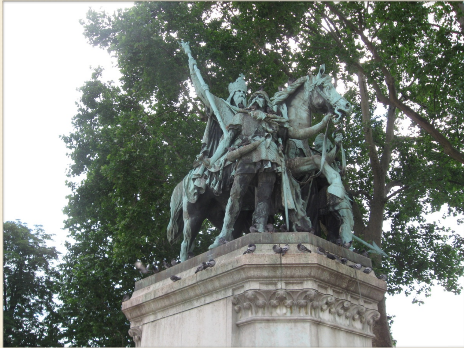
GREAT MOUSTACHES: CHARLEMAGNE AND VERCINGETORIX